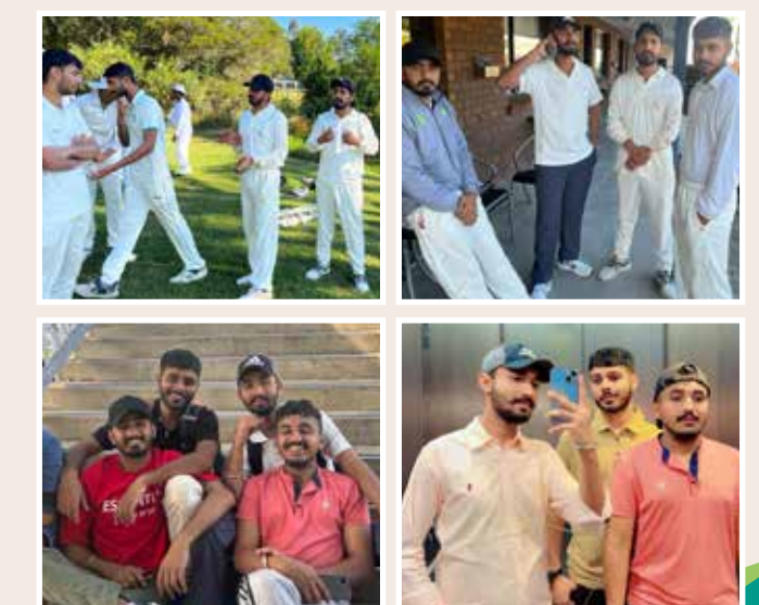
Day-10 Sydney (ver

Breakfast, Practice session at Auburn CC followed by lunch and visit to CBD area of Sydney for shopping and Friday night dinner